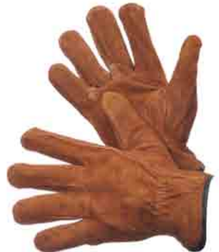
55-1451 BOURBON BROWN SPLIT LEATHER DRIVER WITH KEYSTONE THUMB