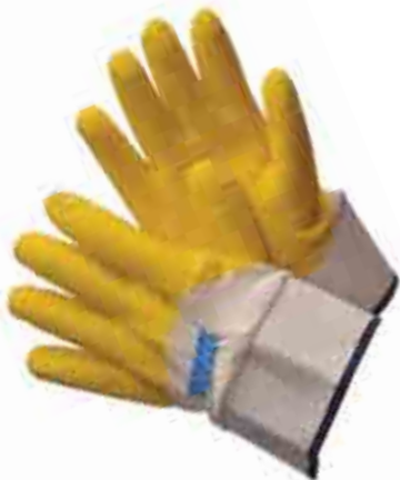
96-5415 NATURAL LATEX COATED - Crinkle Finish Latex Coating - Jersey Lined - 2 1/2" Rubberized Safety Cuff - Size: Men - 10 Dozen / Case