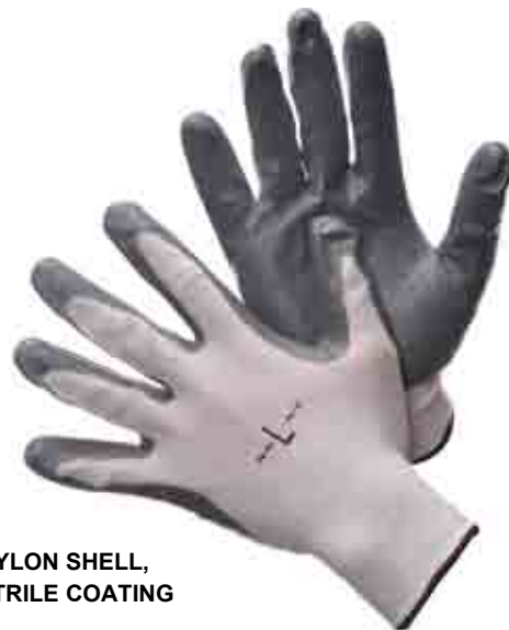
50-8839 WHITE NYLON SHELL, GREY NITRILE COATING