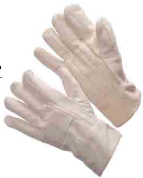
60-1991 STANDARD FEATURE HOT MILL