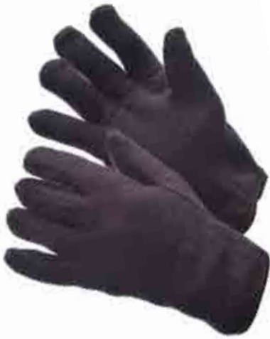
65-1954 LINED BROWN JERSEY