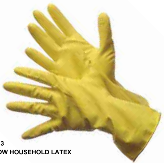
41-0013 YELLOW HOUSEHOLD LATEX