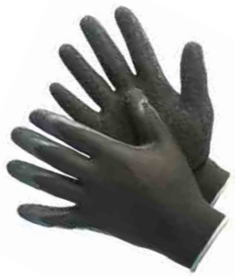
50-8842PBK BLACK POLYESTER SHELL WITH TEXTURED BLACK LATEX COATING