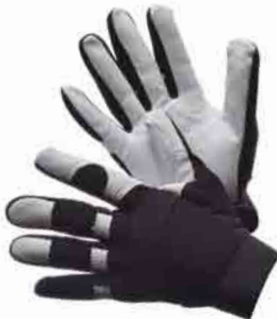
33-8001 MECHANIC GLOVES - GOAT SKIN