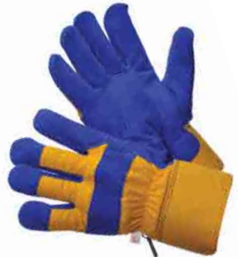
30-5800P-YBU THERMO LINED SPLIT COWHIDE GLOVES