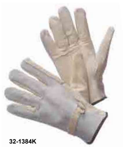
32-1384K GRAIN COWHIDE WITH SPLIT LEATHER BACK - KEYSTONE THUMB WITH PULL STRAP