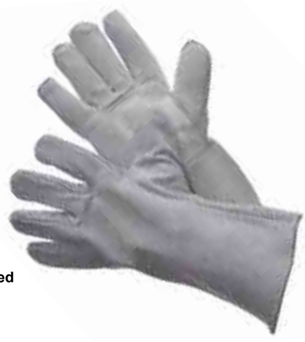
31-4015 GREY WELDING LEATHER GLOVES