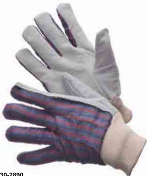
30-2890 CLUTE PATTERN WITH KNIT WRIST