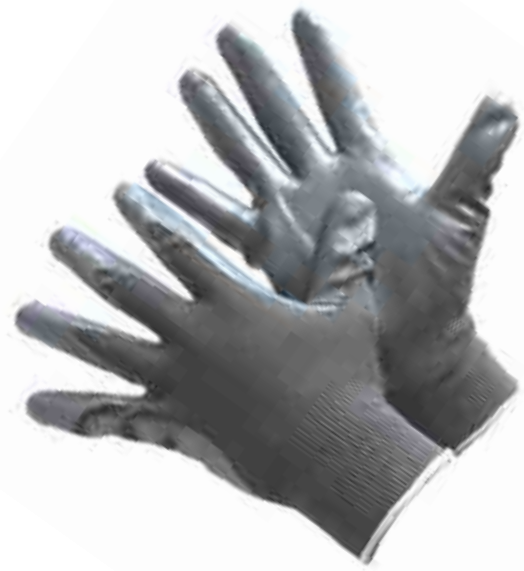
50-8839P-ASST-1 POLYESTER SHELL WITH NITRILE COATING - 1 PAIR TAGGED