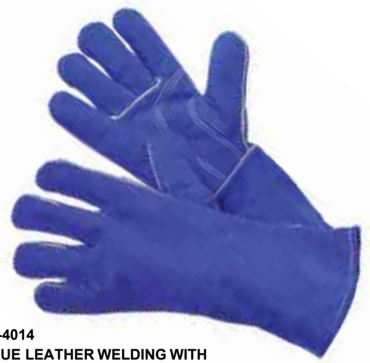
31-4014 BLUE LEATHER WELDING WITH REINFORCED THUMB & PALM