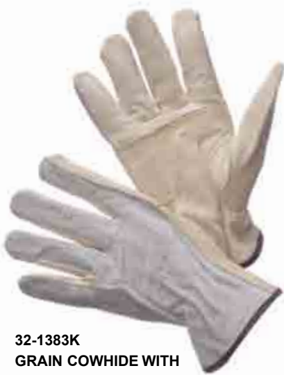
32-1383K GRAIN COWHIDE WITH SPLIT LEATHER BACK -KEYSTONE THUMB