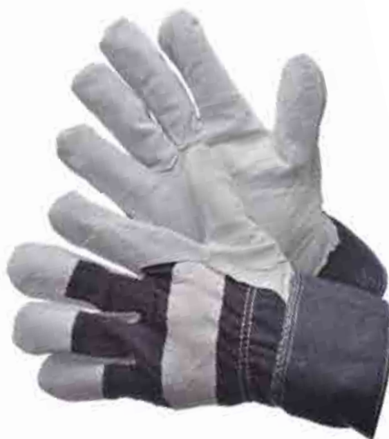
30-3320 FULL FEATURE WITH DENIM CUFF AND SHOULDER SPLIT PATCH PALM