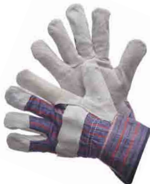
30-1890 FULL FEATURE WITH STARCHED CUFF