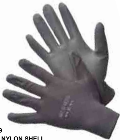
50-6639 WHITE NYLON SHELL, GREY POLYURETHANE COATING