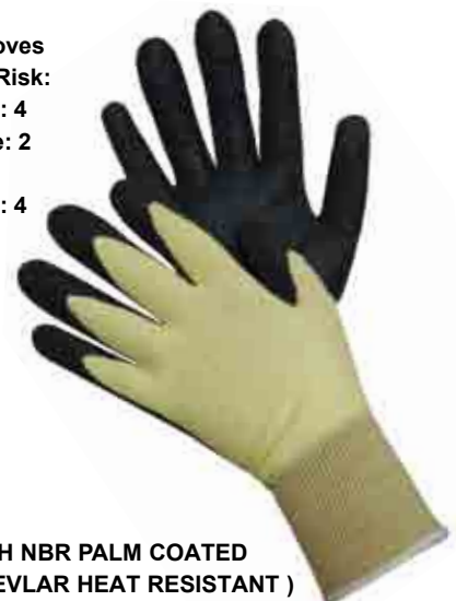
25-3039BK KEVLAR SHELL WITH NBR PALM COATED GLOVES ( CUT & KEVLAR HEAT RESISTANT )

*EN388 Protective Gloves Against Mechanical Risk: Abrasion Resistance: 4 Blade cut Resistance: 2 Tear Resistance: 4 Puncture Resistance: 4