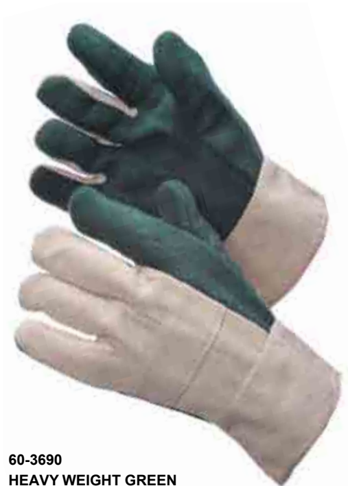
60-3690 HEAVY WEIGHT GREEN HOT MILL - WITH BURLAP