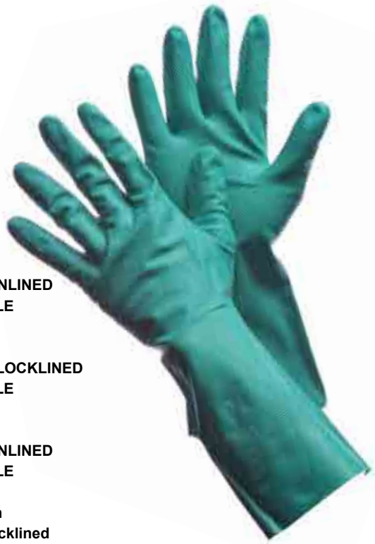
41-0057UN 11 MIL - 13" UNLINED GREEN NITRILE