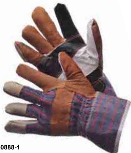
30-0888-1 MULTI COLOR FURNITURE LEATHER