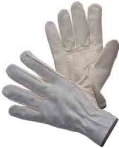
32-1371K GRAIN COWHIDE WITH SPLIT LEATHER BACK - STRAIGHT THUMB