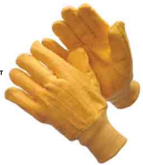
60-2340H GOLDEN CHORE WITH MATCHING KNIT WRIST