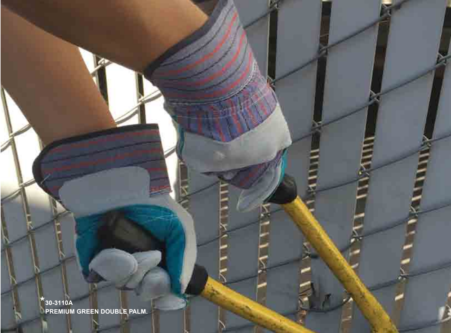
* 30-3110A PREMIUM GREEN DOUBLE PALM.