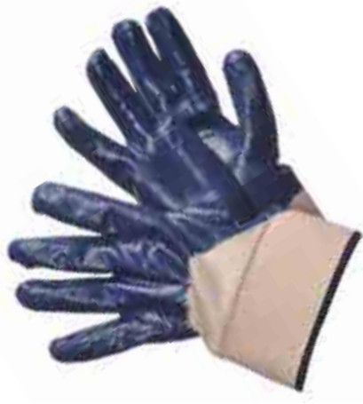
96-6110 SMOOTH FINISH BLUE NITRILE COATED WITH OPEN BACK CANVAS CUFF