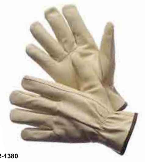
32-1380 PIGSKIN DRIVER GLOVES