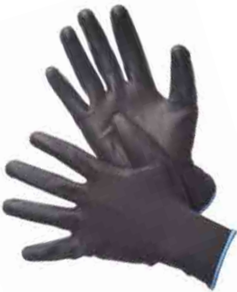
50-6639P-ASST-1 POLYESTER SHELL WITH PU COATING - 1 PAIR TAGGED