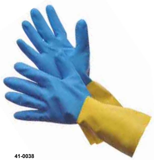
41-0038 BLUE NEOPRENE OVER YELLOW LATEX 13"