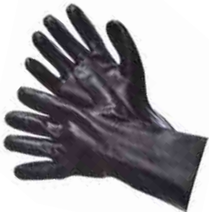
96-5401 SMOOTH FINISH BLACK PVC 12"

S ingle dipped smooth and semi-rough finish provide flexibility and protection. Single and double dipped Poly Vinyl Chloride (PVC) gloves are commonly used in the petro-chemical industry.