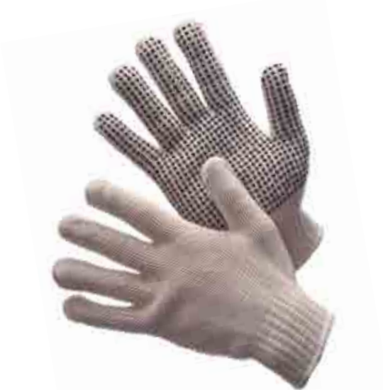
50-1501 MEN COTTON / POLYESTER BLEND