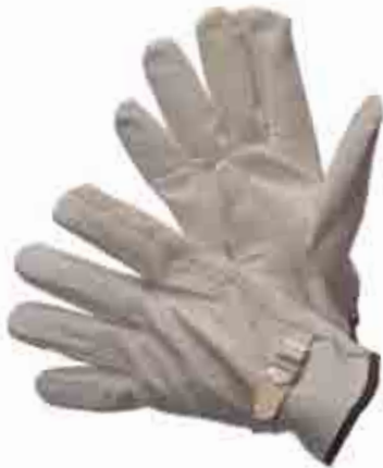
32-1393 GOAT SKIN DRIVER GLOVES