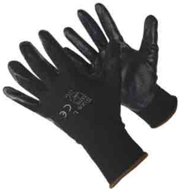
50-8838BKBK BLACK POLYESTER SHELL WITH BLACK NITRILE FOAM