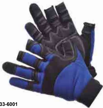
33-6001 MECHANIC GLOVES - SYNTHETIC LEATHER