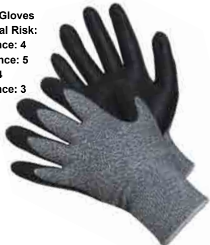
20-5539BK CUT 5 H-POWER SHELL WITH FOAM NBR PALM COATED GLOVES ( CUT RESISTANT )

*EN388 Protective Gloves Against Mechanical Risk: Abrasion Resistance: 4 Blade cut Resistance: 5 Tear Resistance: 4 Puncture Resistance: 3