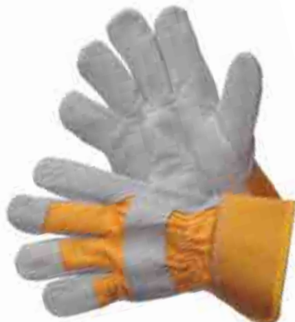
30-8800Y STANDARD SHOULDER LEATHER