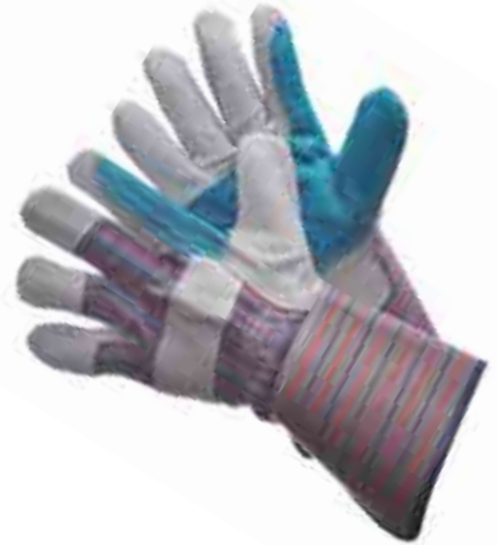
30-3111P JOINT LEATHER DOUBLE PALM