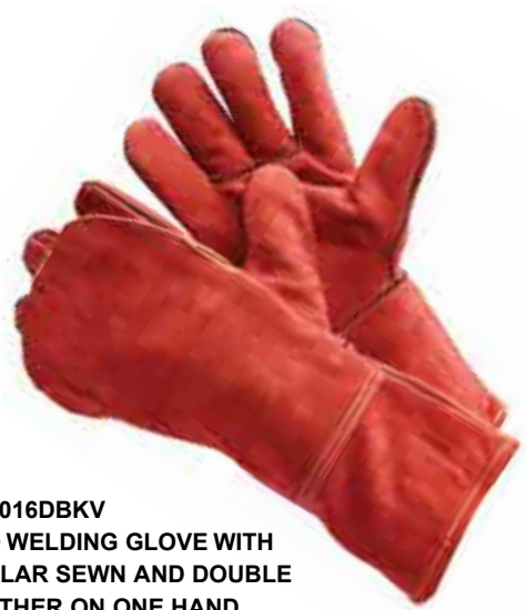
31-4016DBKV RED WELDING GLOVE WITH KEVLAR SEWN AND DOUBLE LEATHER ON ONE HAND