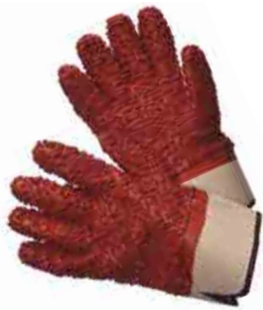
96-5418 NATURAL RUBBER COATED - Red PVC with Rocky Finish - 2 1/2" Rubberized Safety Cuff - Dark Red PVC with Rocky Finish - Size: Men - 10 Dozen / Case