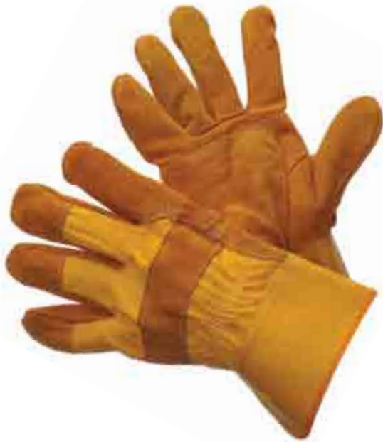
30-3111Y GOLDEN YELLOW JOINT LEATHER PATCH PALM