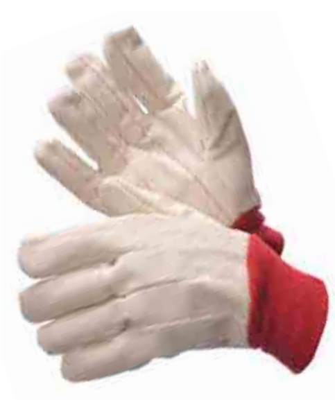
60-1990 DOUBLE PALM CANVAS