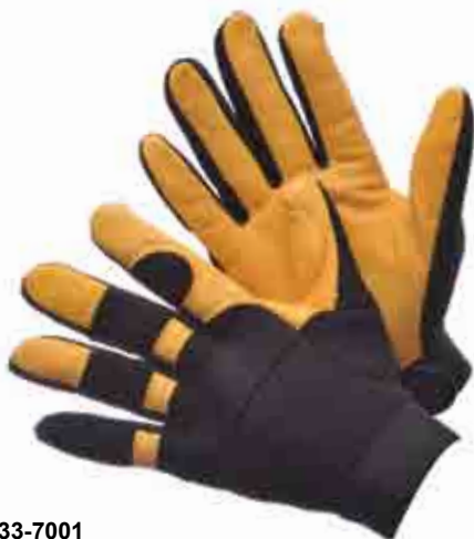
33-7001 MECHANIC GLOVES - DEER SKIN