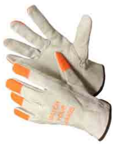
NEW 32-1383HVO COW GRAIN DRIVER GLOVES - B/C Grade Keystone Thumb - Orange HI-VIZ Finger Tips - Sizes: S, M, L, XL - 10 Dozen / Case