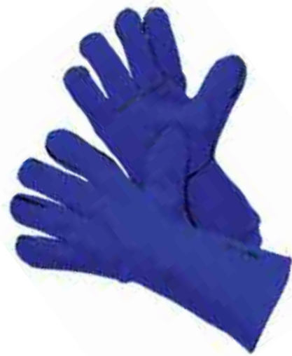
NEW 31-4014EC BLUE WELDING LEATHER GLOVES