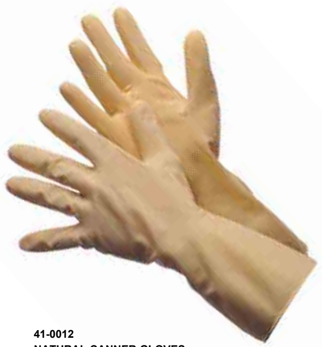
41-0012 NATURAL CANNER GLOVES