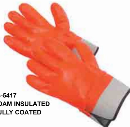
96-5417 FOAM INSULATED FULLY COATED - Semi - Rough PVC - 4 Layers of Protection: Fleece, Polyster, Foam, Waterproof PVC - Fluorescent Orange - 2 1/2" Rubberized Safety Cuff - Size: Men - 5 Dozen / Case