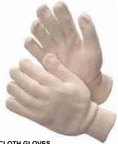
50-1200 18 OZ. TERRY CLOTH GLOVES