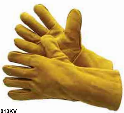
31-4013KV BROWN WELDING GLOVES WITH REINFORCED THUMB