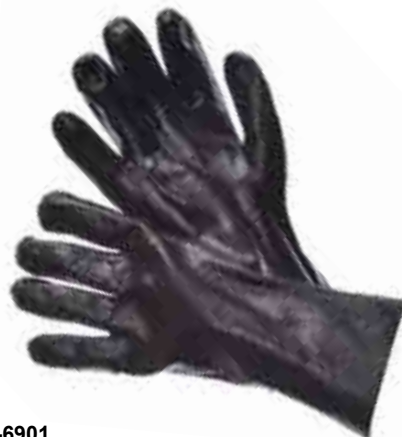
96-6901 SEMI-ROUGH FINISH BLACK PVC 12"