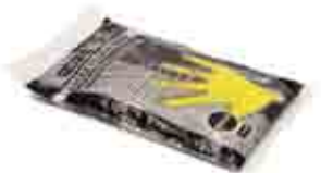
41-0013-1 ROLLED CUFF