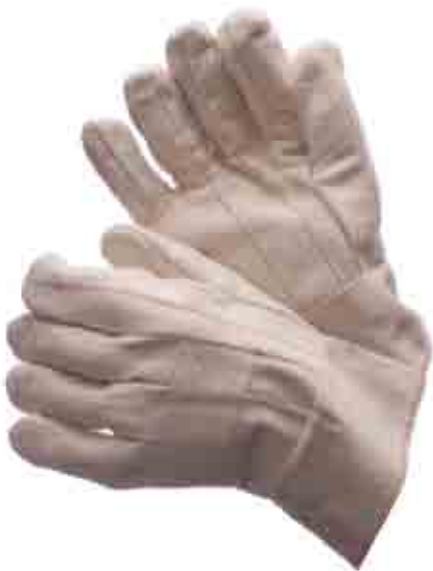
60-2460P HEAVY WEIGHT HOT MILL - 2 1/2" BAND TOP