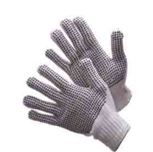
50-2890 MEN COTTON / POLYESTER BLEND