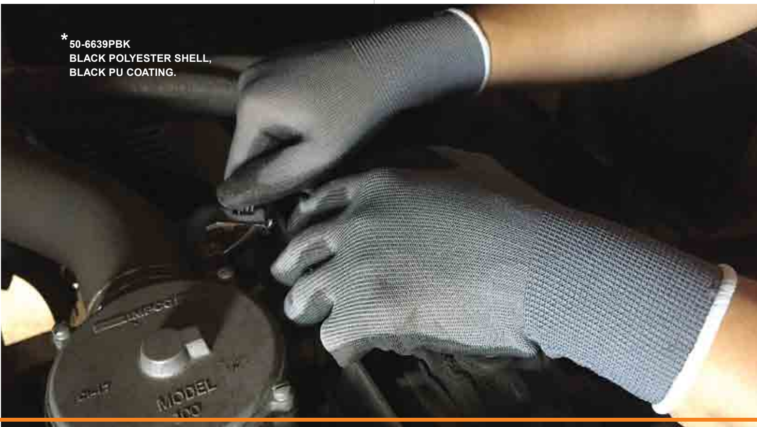
* 50-6639PBK BLACK POLYESTER SHELL, BLACK PU COATING.