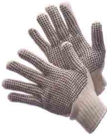
50-2800 MEN COTTON / POLYESTER BLEND