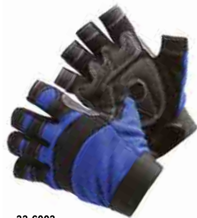
33-6003 MECHANIC GLOVES SYNTHETIC LEATHER - FINGERLESS