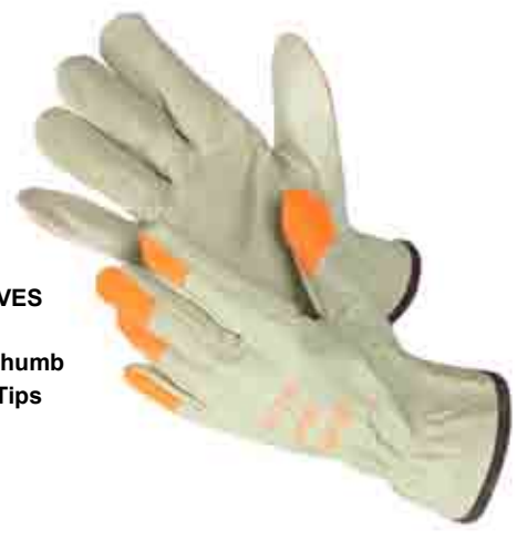
NEW 32-1380HVO PIG SKIN DRIVER GLOVES - B/C Grade Keystone Thumb - Orange HI-VIZ Finger Tips - Sizes: S, M, L, XL - 10 Dozen / Case