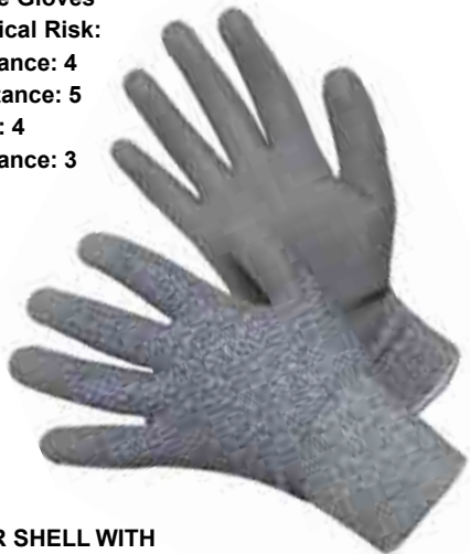
20-5538G CUT 5 H-POWER SHELL WITH PU PALM COATED GLOVES ( CUT RESISTANT )

*EN388 Protective Gloves Against Mechanical Risk: Abrasion Resistance: 4 Blade cut Resistance: 5 Tear Resistance: 4 Puncture Resistance: 3