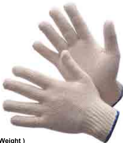
50-1500 ( Regular Weight ) 500g COTTON / POLYESTER BLEND