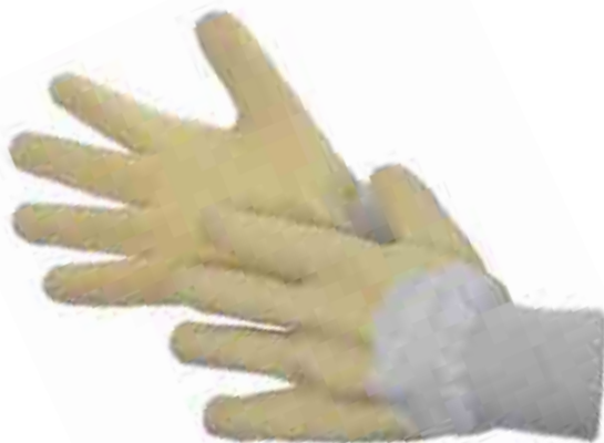
96-5416 NATURAL LATEX COATED - Crinkle Finish Latex Coating - Jersey Lined - Knit Wrist Cuff - Size: Men - 10 Dozen / Case