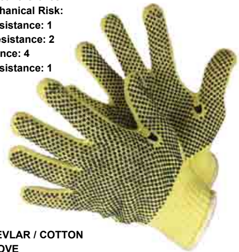
25-2800KV 7 GAUGE KEVLAR / COTTON PLATED GLOVE

*EN388 Protective Gloves Against Mechanical Risk: Abrasion Resistance: 1 Blade cut Resistance: 2 Tear Resistance: 4 Puncture Resistance: 1