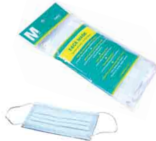
90-103R-K-10 3 PLY EARLOOP MASK ( 10 PIECES )