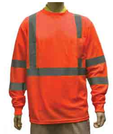
98-3500-O ORANGE CLASS III LONG SLEEVES