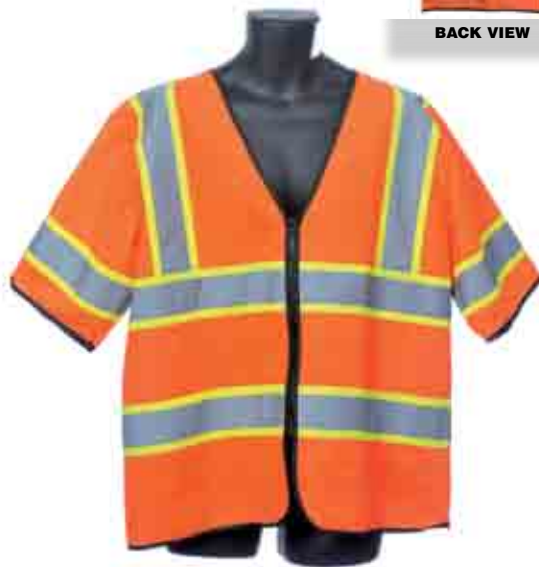
98-3800-O ORANGE CLASS III VEST