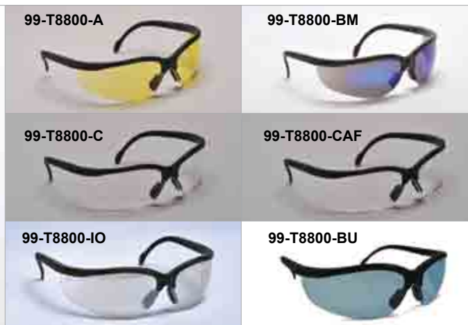
WOLVERINE 99-T8800-A - AMBER LENS