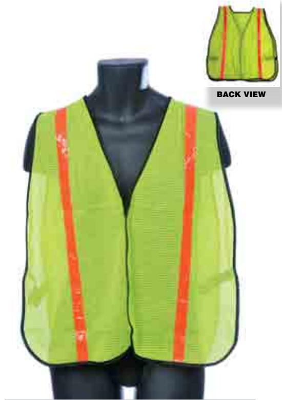
98-1301-G GREEN MESH / ORANGE REFLECTOR