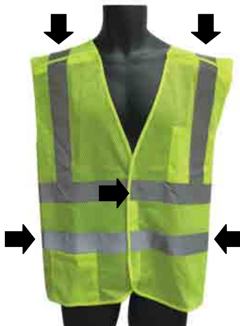
98-2601G LIME CLASS II 5-POINT BREAKAWAY VEST