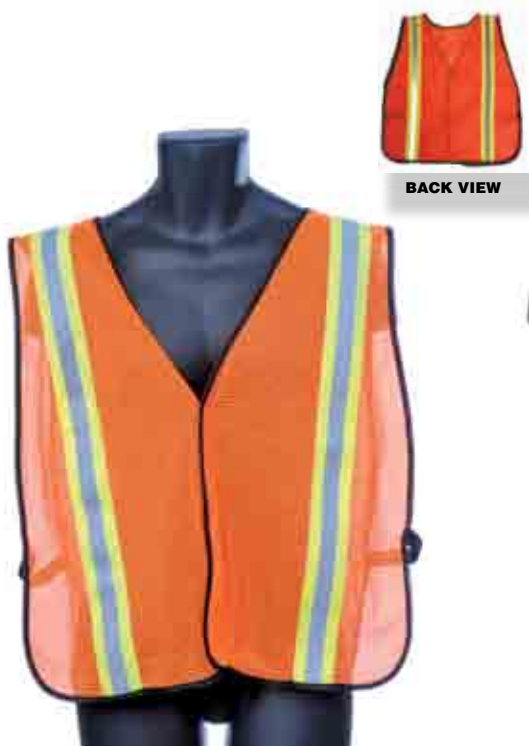
98-1200-O ORANGE MESH