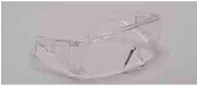
VISITOR SPECS 99-V8000-C - CLEAR LENS