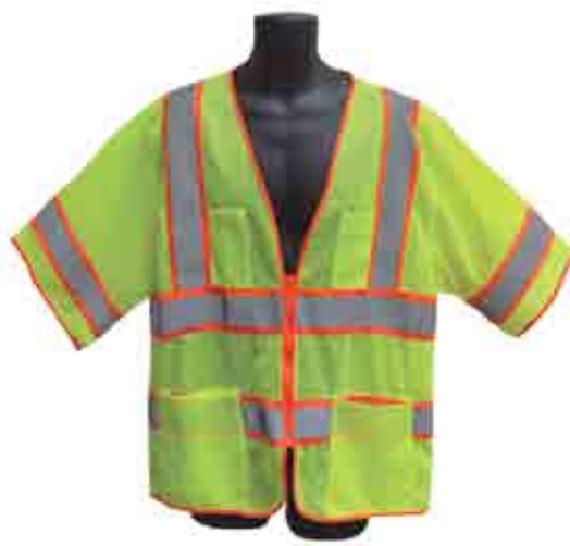
98-3601-G LIME CLASS III VEST