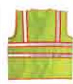
98-5901-G BACK VIEW