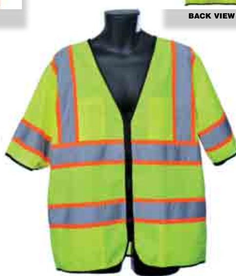
98-3801-G LIME CLASS III VEST