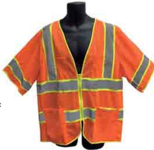
98-3600-O ORANGE CLASS III VEST