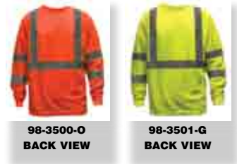
98-3500-O BACK VIEW

CLASS III vests are required for workers where traffic exceeds 50MPH, where high risk tasks are performed. Also when workers who need to be conspicuous through the full range of motions at a minimum distance of 1,280 feet. Highest visibility provided for workers in high risk areas / situations who need fully range body motions. Generous armholes provided for comfortable fit, contrasting stripes for extra day & night visibility and multiple pockets are provided inside upper left & right. 360° provides full body outline. Non-Conductive nylon zipper front closure.