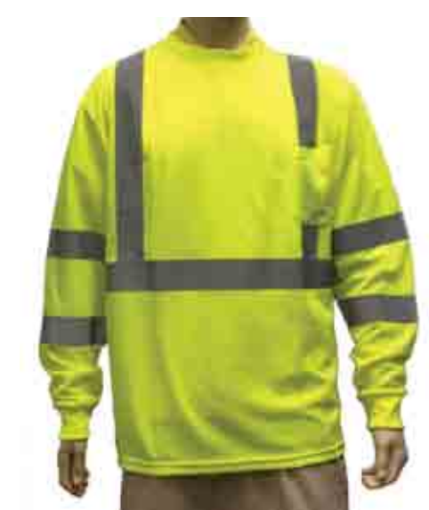
98-3501-G LIME CLASS III LONG SLEEVES