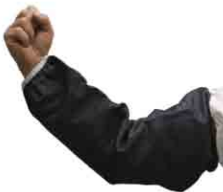
10-2007BD BLUE DENIM SLEEVES