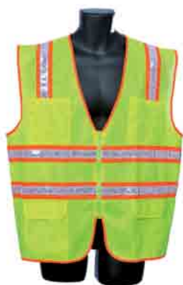
98-5901-G LIME SURVEYOR'S VEST