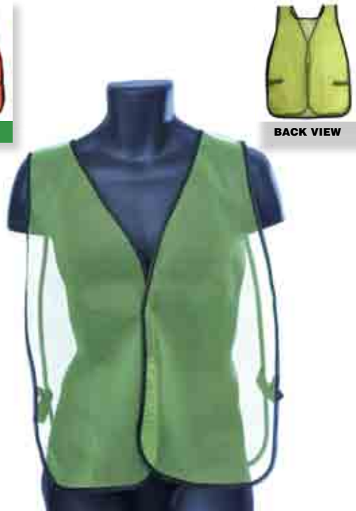
98-0301-G GREEN MESH