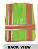
98-2701-G LIME CLASS II VEST