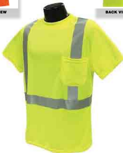
98-2501-G GREEN CLASS II T-SHIRT