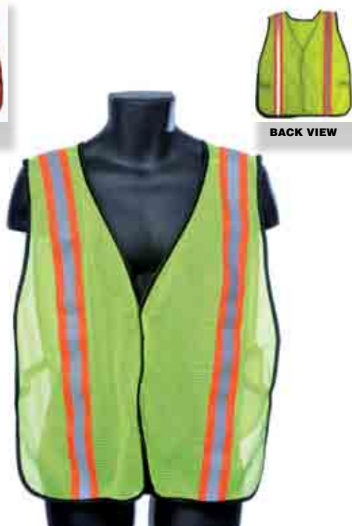
98-1201-G GREEN MESH