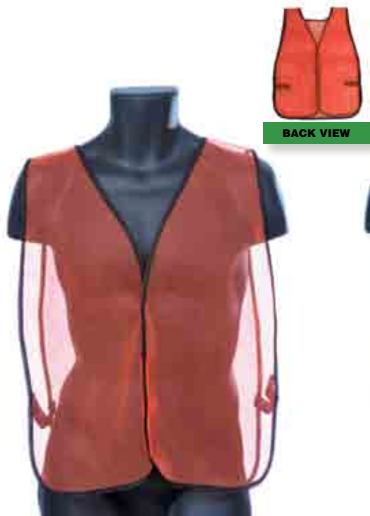
98-0300-O ORANGE MESH