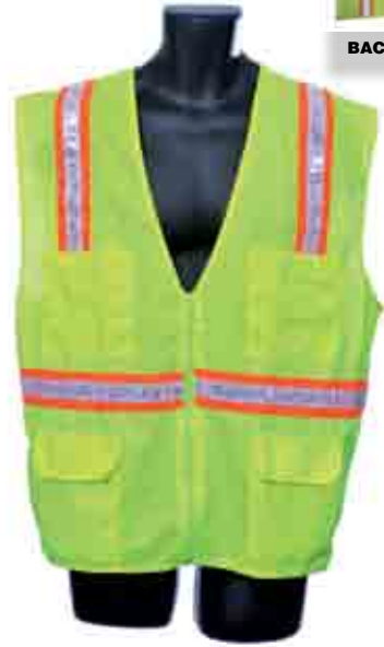
98-5801-G LIME SURVEYOR'S VEST