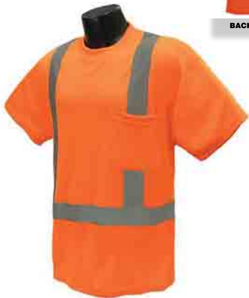
98-2500-O ORANGE CLASS II T-SHIRT