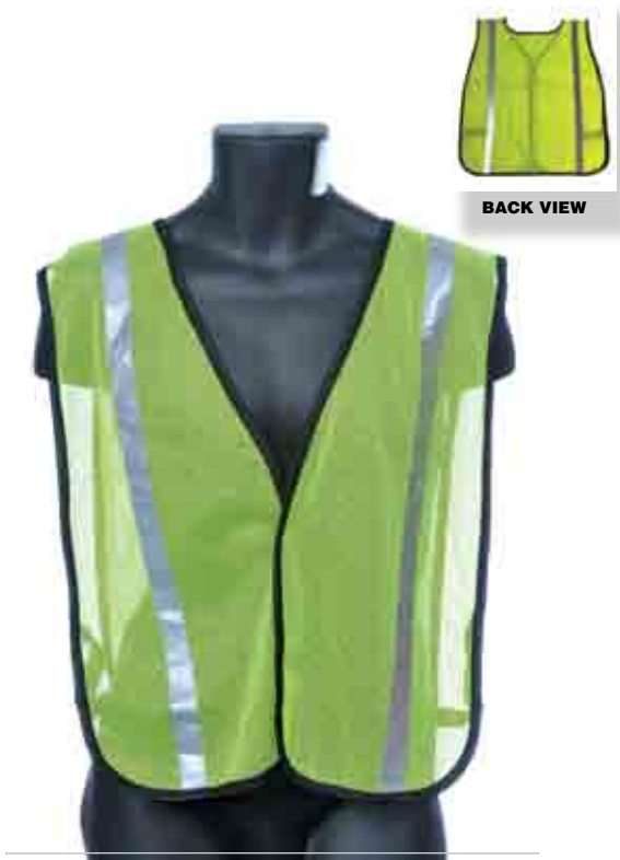
98-1301-GS GREEN MESH / SILVER REFLECTOR