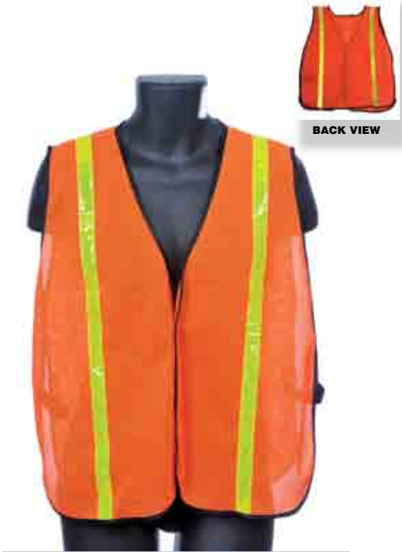
98-1300-O ORANGE MESH / YELLOW REFLECTOR