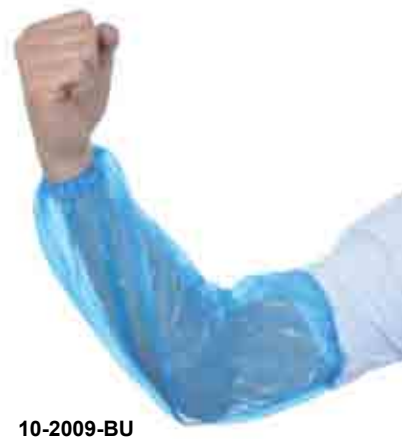
10-2009-BU BLUE - 18" PE SLEEVES ( shown above )