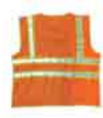
98-5900-O BACK VIEW

M ultiple pockets are offered in Surveyors' Vest: Upper left with 4-division pencil pockets, upper right 2-division pockets, two outside flap pockets with velcro 360° reflectivity provides full body outline. Non-Conductive nylon zipper front closure.