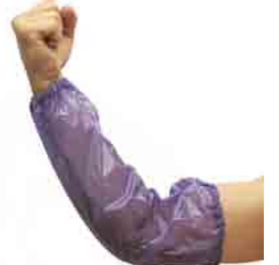
10-2008V-BU VINYL ( PVC ) SLEEVES - BLUE ( shown above )