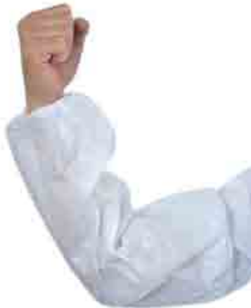
10-2011-W 18" POLYETHYLENE OVER PP SLEEVES