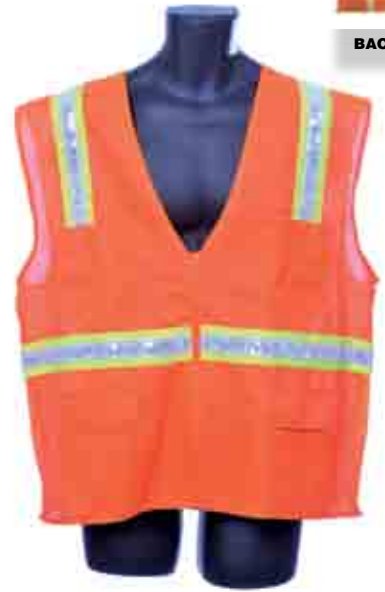
98-5800-O ORANGE SURVEYOR'S VEST