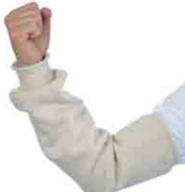
10-2020 18" TERRY CLOTH SLEEVES