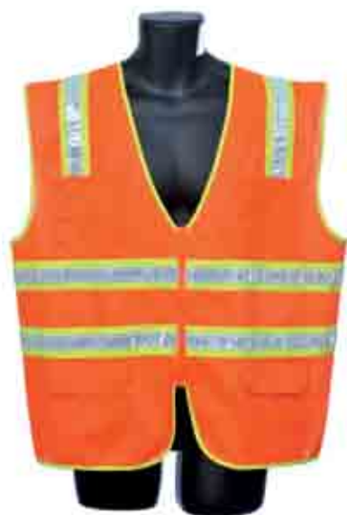
98-5900-O ORANGE SURVEYOR'S VEST