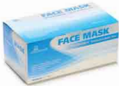
90-103R-K 3 PLY EARLOOP MASK - BLUE