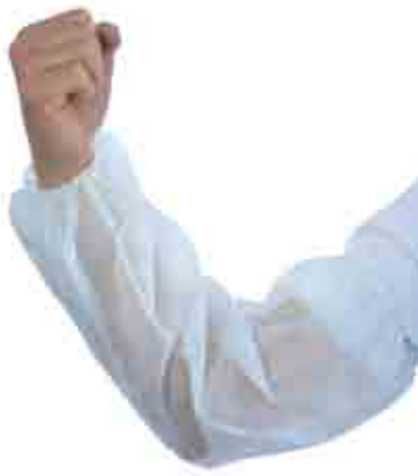
10-2010-W 18" POLYPROPYLENE SLEEVES

10-2010-W-E 18" POLYPROPYLENE SLEEVES - ECONOMICAL GRADE